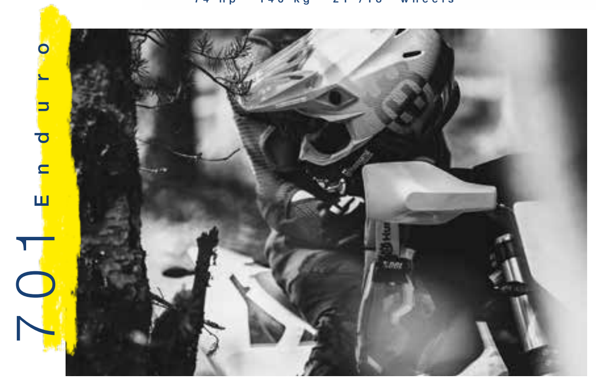
READY TO GO WHERE IMPULSE TAKES YOU, THE HUSQUARNA TOI ENDURO IS BUILT TO DELIVER UNCOMPROMISED PERFORMANCE ON, AND OFFROAD.