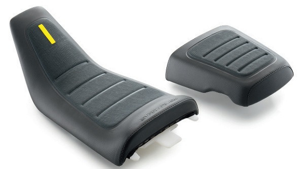
ERGO SEAT ERGO PILLION SEAT