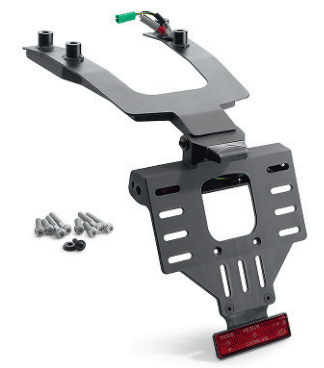
LICENCE PLATE HOLDER SUPPORT